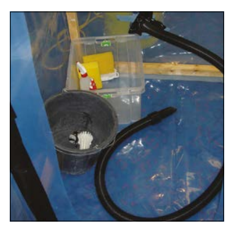
Put the equipment you need inside the enclosure before you start