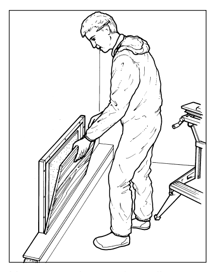
Use non-asbestos boarding to protect asbestos