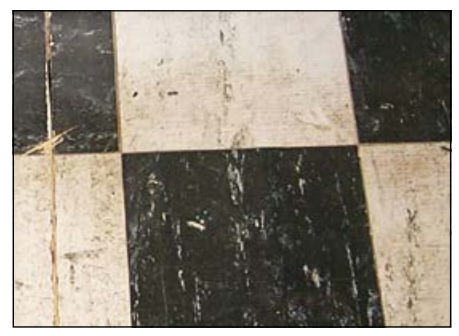
Asbestos paper linings can be found in boiler casings, under lino or tiles and many other places