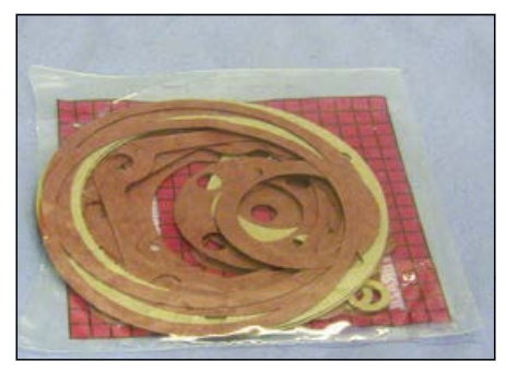
Paper gaskets can contain asbestos